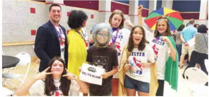
Congratulations to our Battle of the Books Team on winning the Best Team Spirit Award for the second year in a row!

student succeed in school in a number of ways. From finding the perfect science fair project to helping with research for a paper, our staff is here to guide you. We also have a tool that provides online homework help 24 hours a day. Access brainfuse to talk to live tutors in math, science, reading, writing, standardized tests and more. Just go to our website and scroll down to the brainfuse slide and click. Help is at your fingertips!